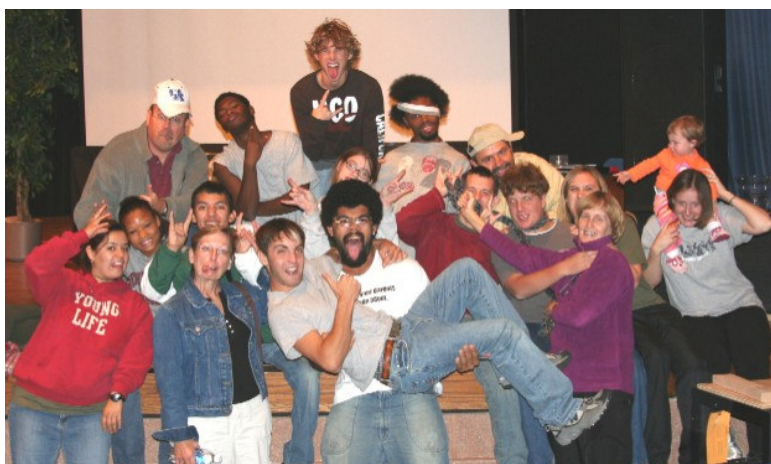
DeafTeen Quest teens and leaders in Ft. Wayne, Indiana

We had a great experience with DTQ® teens from Lexington, Danville and Louisville (KY) at the Youth For Christ weekend event, Go MAD (Make a Difference). There were seventeen DTQuest® folks (students and leaders) and about 850 hearing students at this event. We were able to process the messages with our teenagers after the worship services and had lots of small group and one-on-one time.