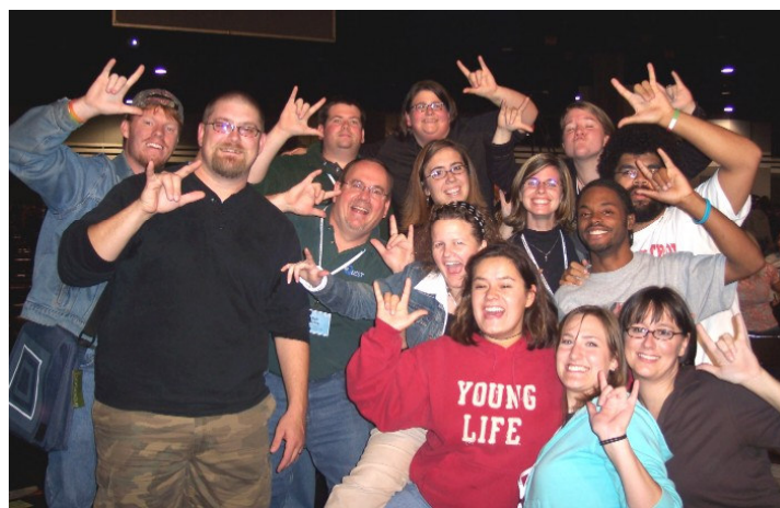
Deaf ministry leaders convene in Atlanta for training and fellowship